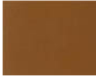
Br:4 Dark Brown