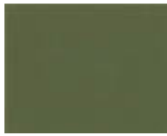
G:8 Medium Gray/Olive