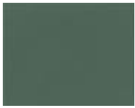
G:4 Dark Gray/Green