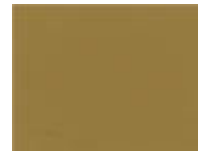
Br:8 Medium Yellow/ Brown