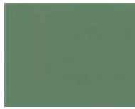
G:3 Medium Gray/Green