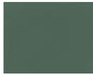
G:4 Dark Gray/Green