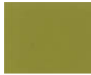
G:6 Medium Olive