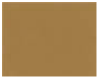
Br:3 Medium Brown