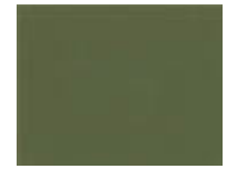
G:8 Medium Gray/Olive