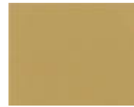
Br:7 Light Yellow/ Brown