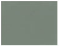
Bl:2 Dark Blue/Gray