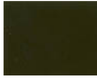
G:9 Dark Gray/Olive