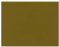
Br:9 Dark Yellow/ Brown