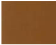
Br:4 Dark Brown