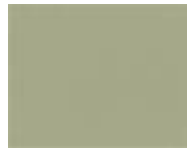
G:5 Light Olive