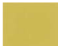
Y:10 Medium Yellow