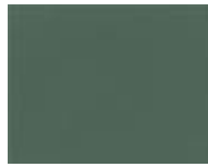
G:4 Dark Gray/Green