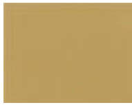
Br:7 Light Yellow/ Brown