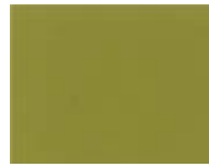
G:6 Medium Olive