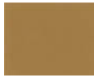
Br:3 Medium Brown