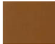
Br:4 Dark Brown