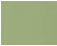
G:2 Light Gray/Green