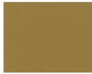
Br:8 Medium Yellow/ Brown