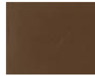
Br:11 Dark Gray/ Brown