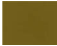
Br:9 Dark Yellow/ Brown