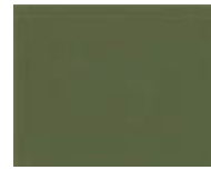
G:8 Medium Gray/Olive