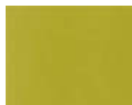
Y:11 Dark Yellow