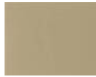
Br:10 Light Gray/ Brown