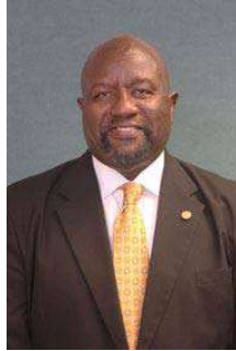
Sherman P. Lea, Mayor