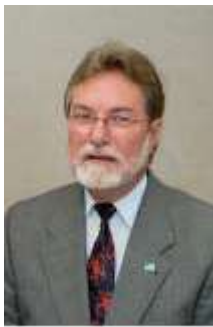
William D. Bestpitch Council