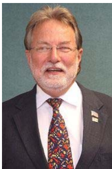
William D. Bestpitch Council