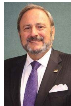
Raphael E. Ferris Council